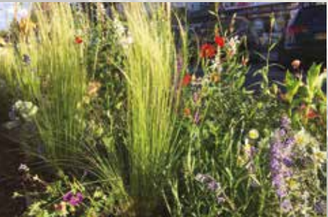
Photos: Arch Garden display at Letchworth Food & Drink Festival

Please call the office on 01462 686491 to make an appointment.